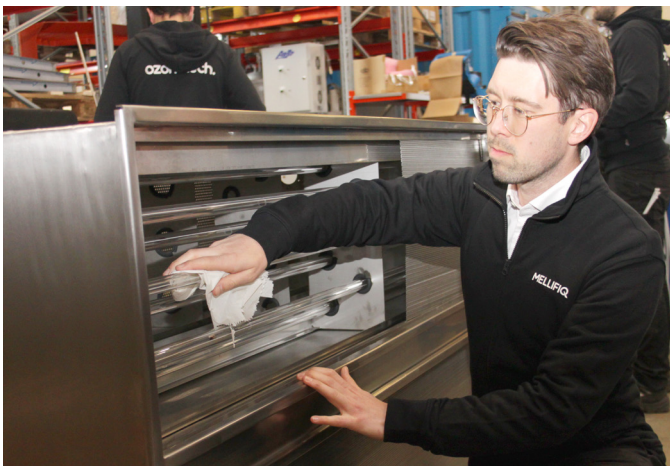
The Aurora UV system lines are design with superior maintenance flexibility and parts replacement.

Elektravägen 53 SE-126 30 Hägersten, Sweden +46 10 252 30 00 www.mellifiq.com